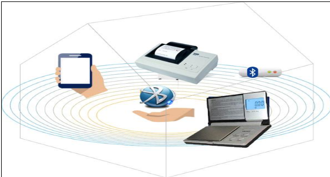
Figure 2: Multiple hardware units (weighing scale, barcode scanner and the mobile handheld) communicate via Bluetooth.

The fleet team is provided with the mobile weighing machines and mobile scanners. These are used to weigh the waste bags and the scanner sends the details like client information, color code of bag, along with the weight it contains in real time to the server. Geo location is also sent along with this information to serve as another confirmation of the visit to the actual location. The three hardware units – Handheld terminal, printer and weighing scale are connected via Bluetooth. Establishing and maintaining device connectivity with pre-chosen and older models of devices was one of the significant challenges faced and overcome by the BizMerlin engineering team.